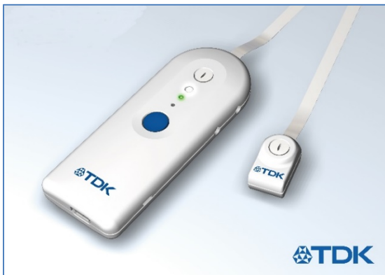
Figure 1. Conceptual View of a Social Distancing Tag